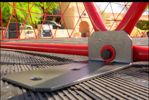
Anchoring: Pacific Domes will supply the appropriate anchors to secure the dome frame to a deck, asphalt, concrete or earth. Powder Coating: We offer powder coating as an option. It's a quality colorful finish that can be applied to