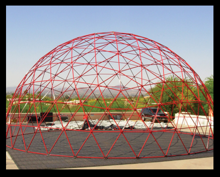
Powder Coating: We offer powder coating as an option. It's a quality, colorful finish that can be applied to the frame. There are many colors to choose from and the coating will not fade.