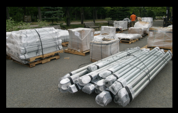
Portability: Our event dome frames pack down into small bundles that are easy to ship and handle. All domes come with illustrations and instructions for easy frame assembly. Our professional staff can provide on-site training.