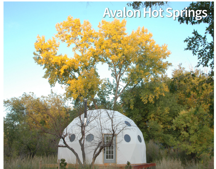
Avalon Hot Springs