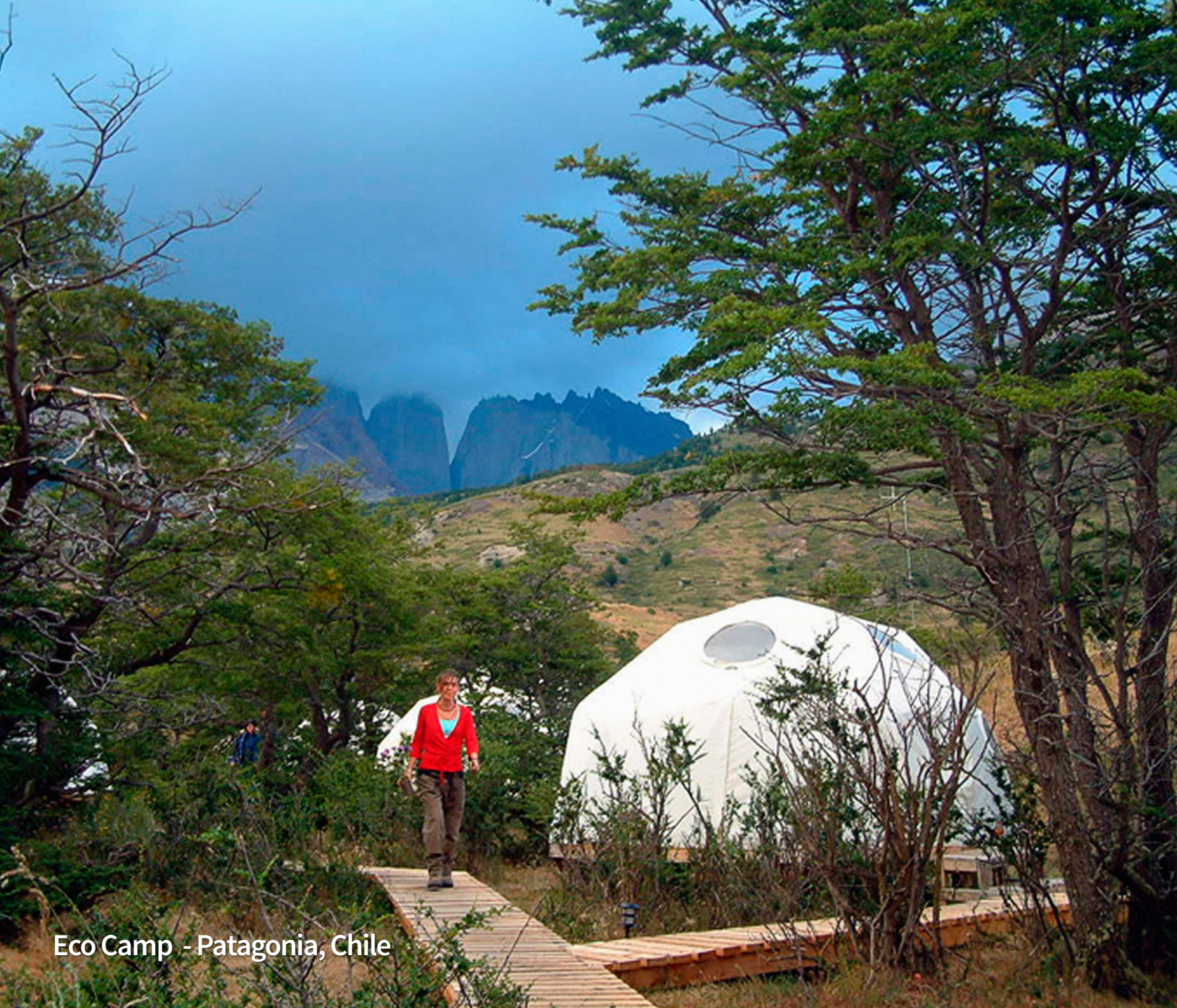
Eco Camp - Patagonia, Chile