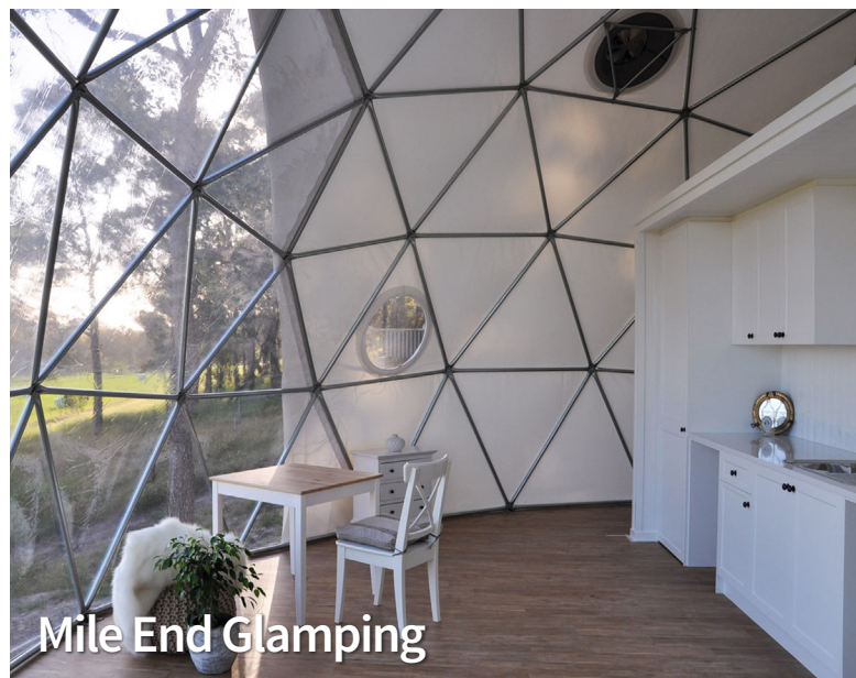
Mile End Glamping