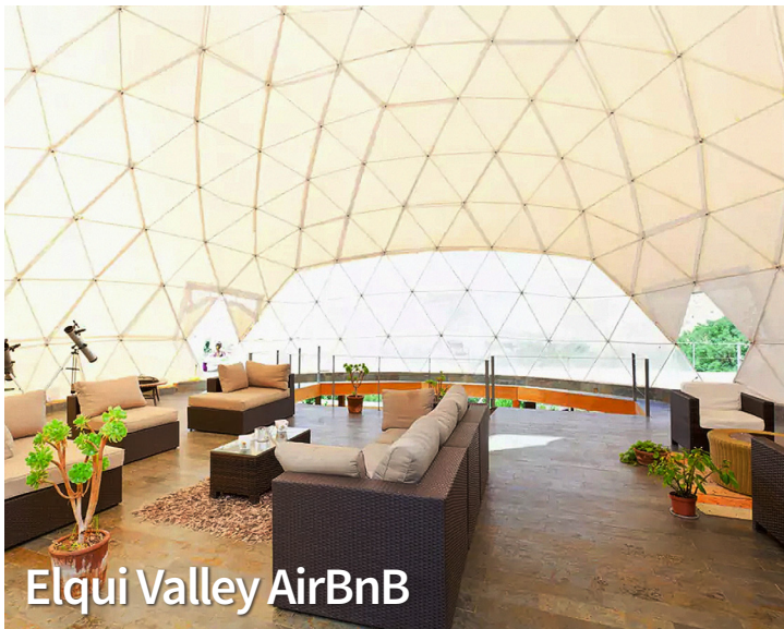
Elqui Valley AirBnB