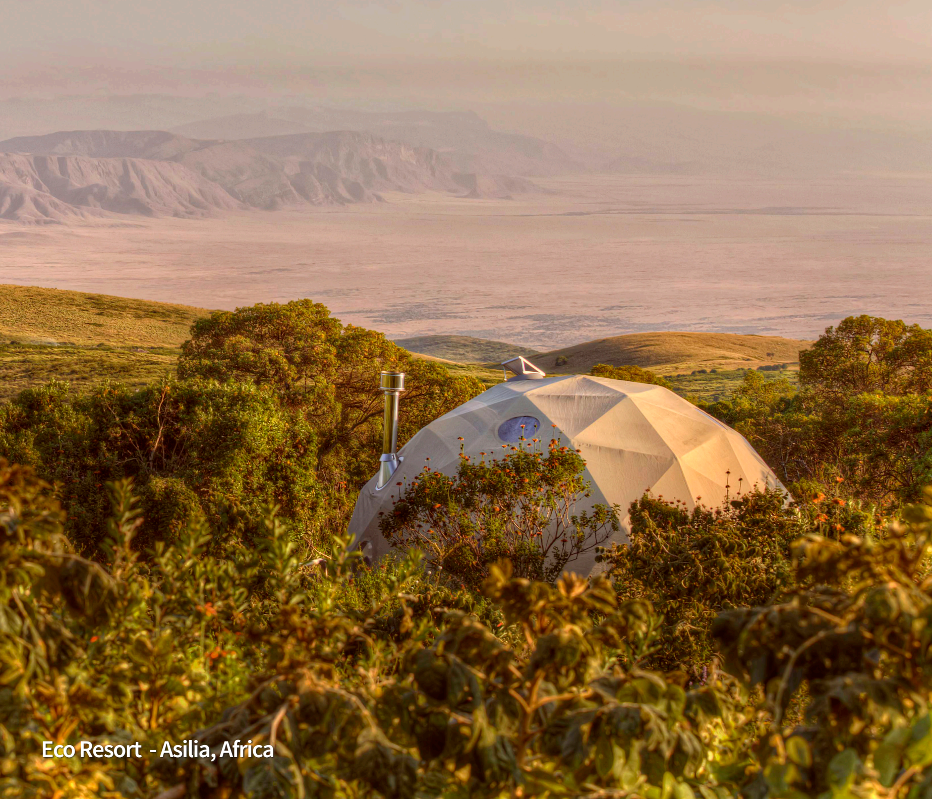
Eco Resort - Asilia, Africa