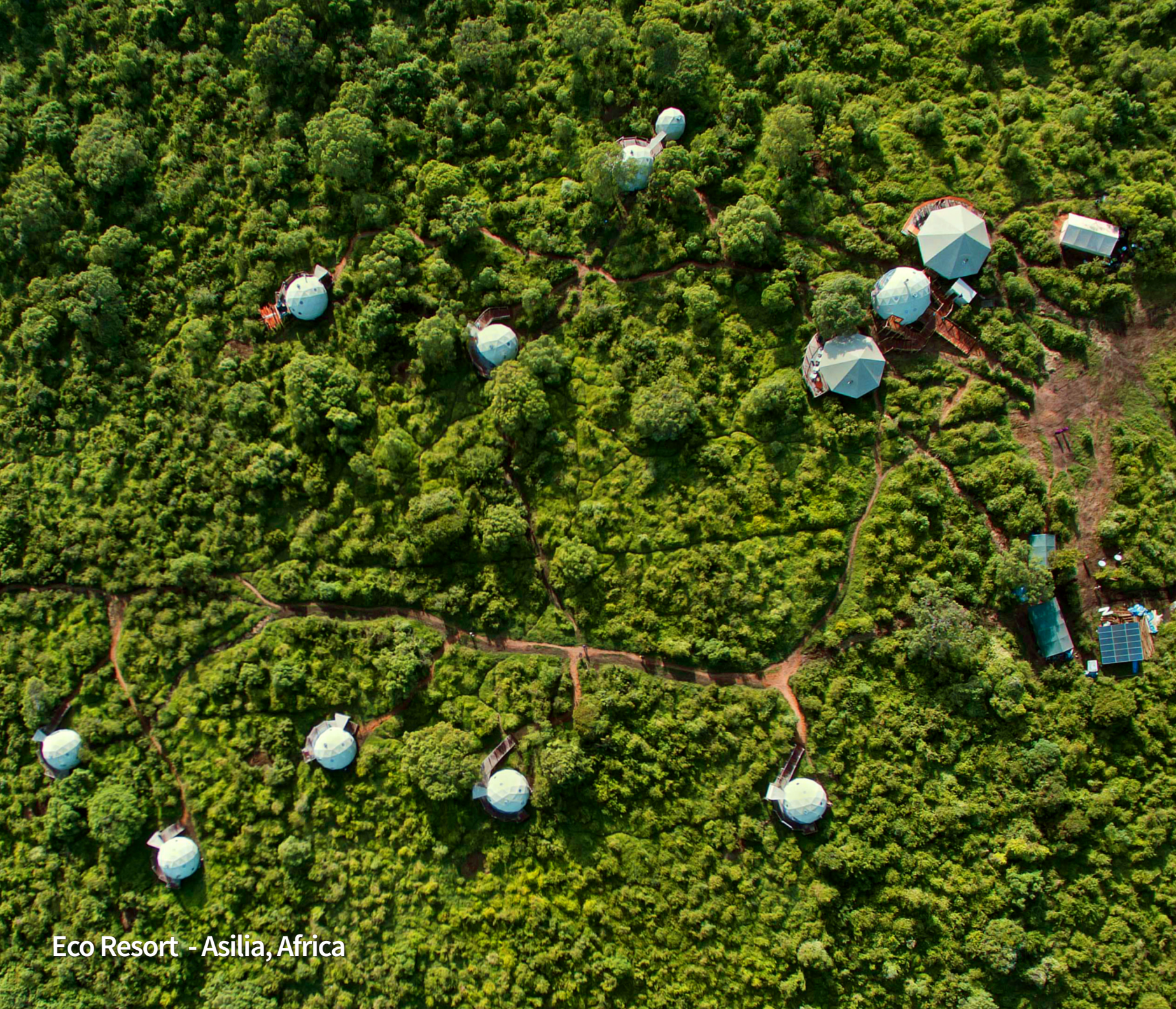
Eco Resort - Asilia, Africa