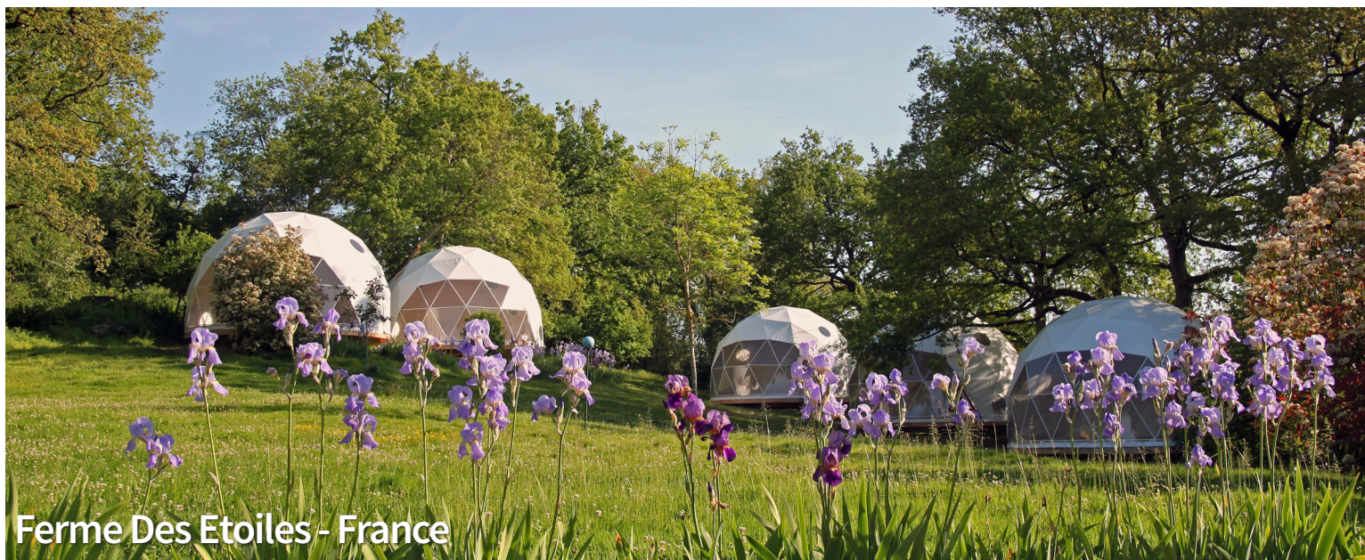
Ferme Des Etoiles - France