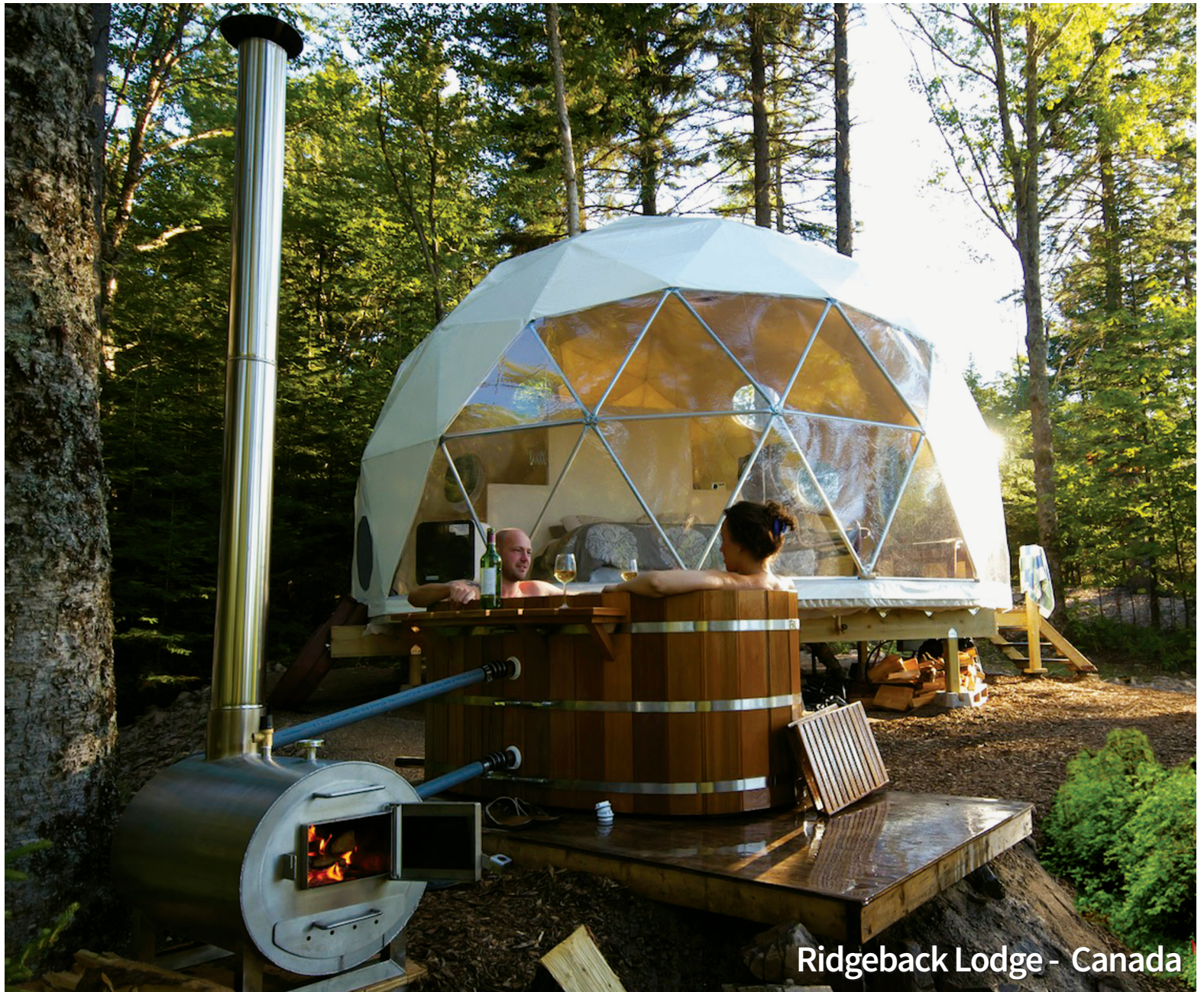
Ridgeback Lodge - Canada