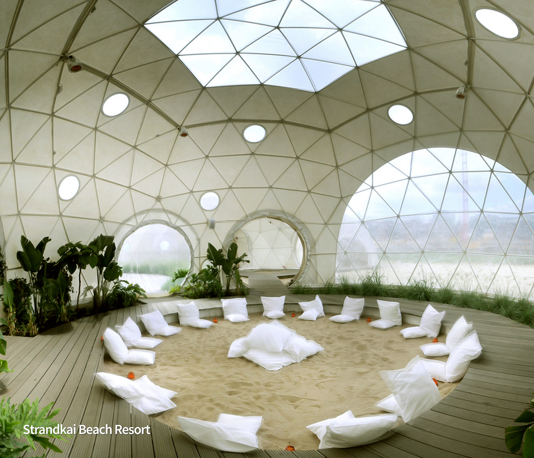
Strandkai Beach Resort