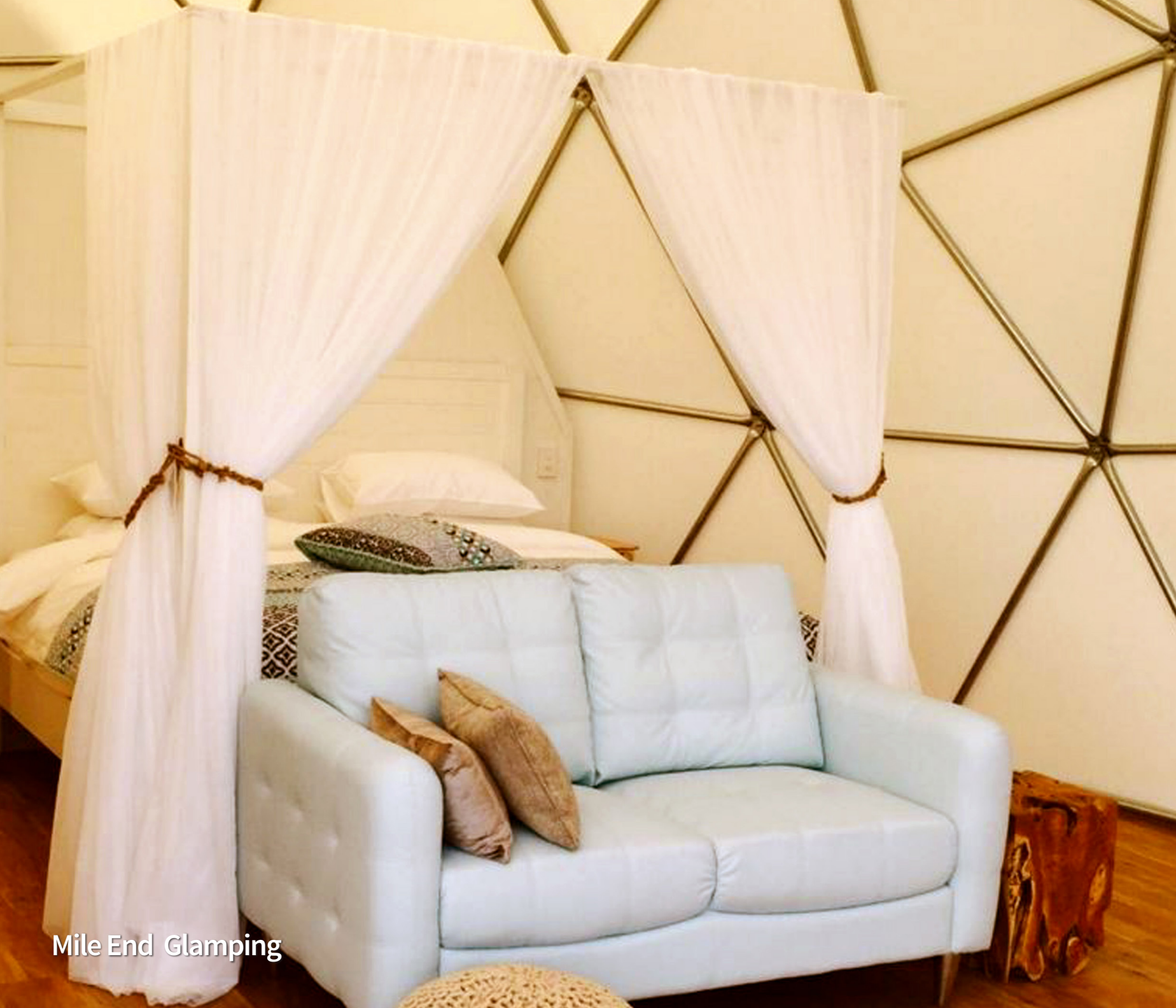
Mile End Glamping