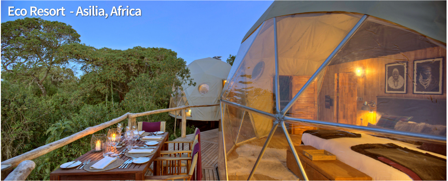
Eco Resort - Asilia, Africa