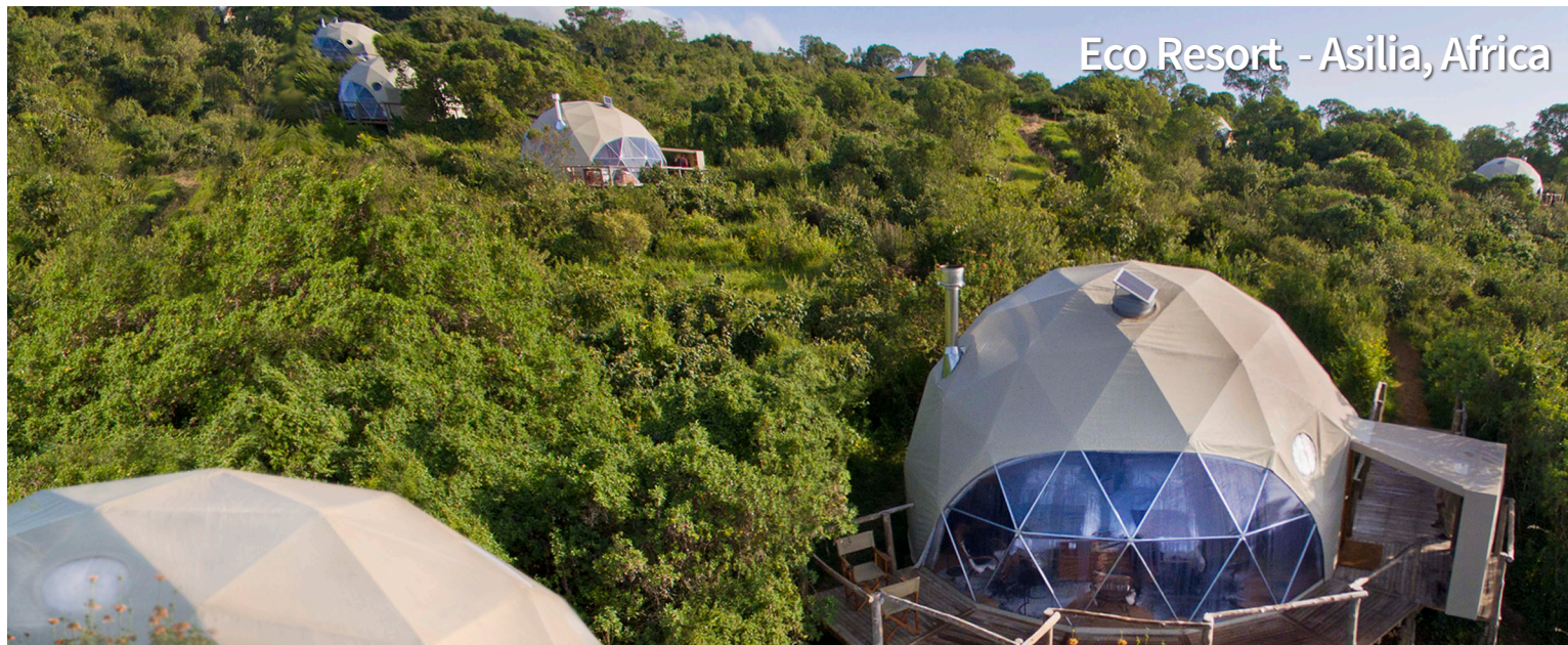
Eco Resort - Asilia, Africa