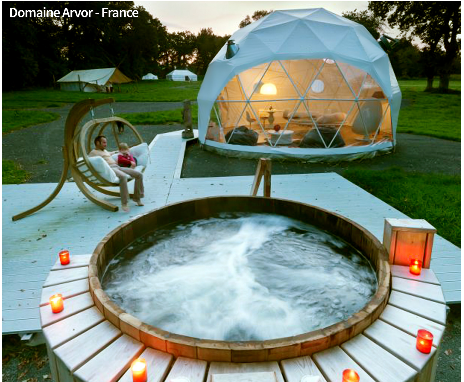
Domaine Arvor - France